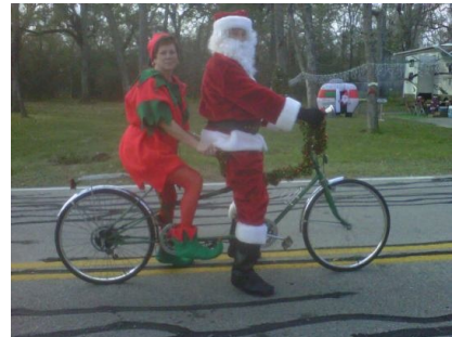
Santa and an elf visit the campground on Christmas Eve.