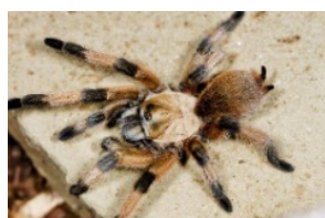
Rio Grande Gold

Despite their mostly placid nature, tarantulas are capable of defending themselves or escaping predators. Their first tactic is simply to run for cover. When the predator pursues, they will flick urticating hairs from their back legs or abdomen, causing an allergic reaction in the pursuer's eyes and/or mouth. If the threat continues, they will rise up on their hind legs with the front legs raised and fangs exposed, and will bite. But, as mentioned before, the severity of the bite is no worse than a bee sting.