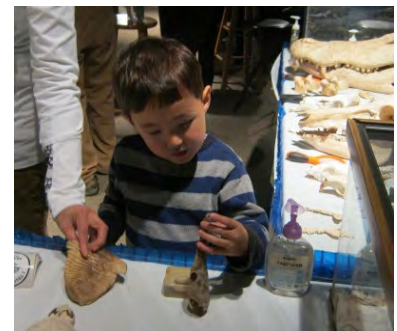
Learning is fun at BBSP Outreach