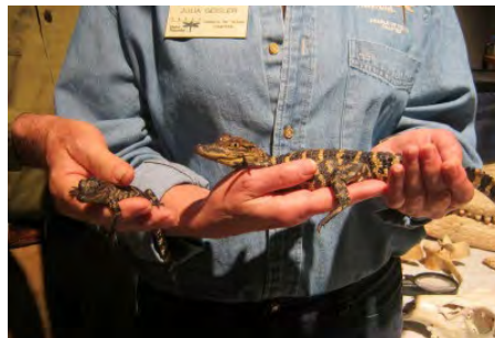
Comparing alligators at Sea Center Texas