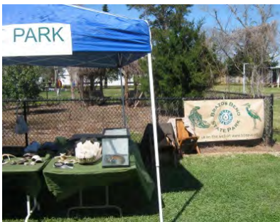
Brazoria Heritage Day