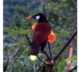
A Montezuma Oropendola enjoys papaya

Mid January 2013 – just the right time to escape Houston's winter chill (and Vermont's icy grip!) to spend a week amid Costa Rica's lush beauty. Six travelers from Brazos Bend State Park joined a fantastic guide and a steely-nerved driver for the eight-day adventure. We began in a central highlands nature reserve, in awe of brilliantly colored tanagers and hummingbirds. Over the next seven days, we hiked the trails of a tropical research station, came upon an anteater in a national park forest, marveled at baby Spectacled Caimans being watched over by their mama (no 2-finger touches here!), saw 6 different kingfisher species on a morning riverboat ride, overnighted on the flanks of a steaming volcano, and bounced our way over "hanging bridges" as we explored the rainforest canopy. Plus, we ate enough delicious tropical fruit to last a long while!