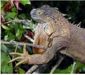
An iguana ruling from the treetops

Mid January 2013 – just the right time to escape Houston's winter chill (and Vermont's icy grip!) to spend a week amid Costa Rica's lush beauty. Six travelers from Brazos Bend State Park joined a fantastic guide and a steely-nerved driver for the eight-day adventure. We began in a central highlands nature reserve, in awe of brilliantly colored tanagers and hummingbirds. Over the next seven days, we hiked the trails of a tropical research station, came upon an anteater in a national park forest, marveled at baby Spectacled Caimans being watched over by their mama (no 2-finger touches here!), saw 6 different kingfisher species on a morning riverboat ride, overnighted on the flanks of a steaming volcano, and bounced our way over "hanging bridges" as we explored the rainforest canopy. Plus, we ate enough delicious tropical fruit to last a long while!