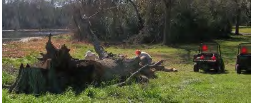
Maintenance Crew at Work