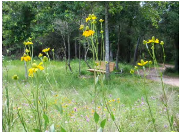
Blooming Rattlesnake Master on the pocket prairie by the Observatory

Set and checked hog traps Treated Chinese Tallow trees