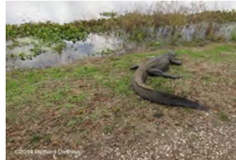
Gator on trail.