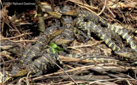
Gator babies: Photo courtesy Rick Dashnau

Clouds began covering the sky about 12, so I packed up my scope and moved to 40 Acre Lake.