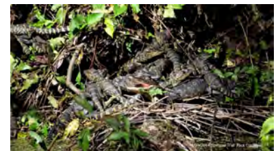
Alligator babies from the nest near the spillway, late Nov.