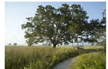
Visitation continues to climb at parks including Brazos Bend State Park, shown