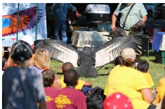
Andean Condor at the Oct 25 Earth Quest