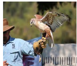
Harris's Hawk on display at the Oct 25 Earth Quest Program.