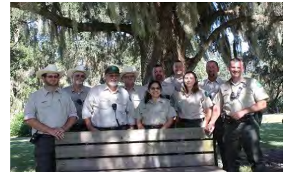
Park staff at the ribbon-cutting welcoming BBSP into the Central Fort Bend Chamber Alliance. See Page 5.

Texas to receive Deepwater Horizon Oil Spill Restoration Funding—TPWD News Release Oct