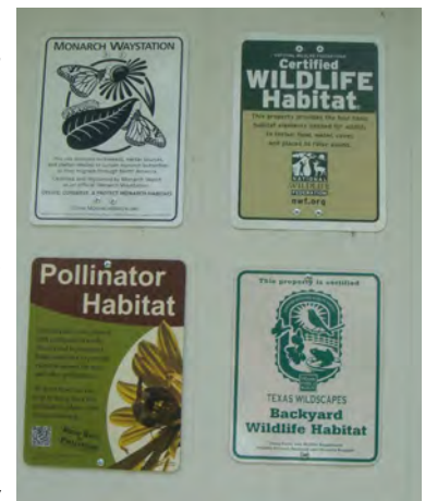
Backyard habitat certifications.