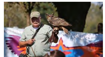
Eurasian Eagle Owl at the Oct 25 Earth Quest