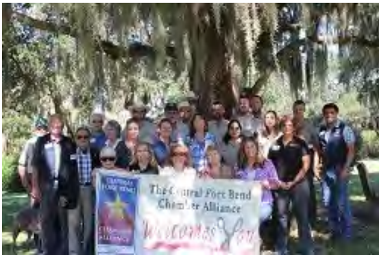
Bbsp staff and volunteers with members of the CFBCA at the Bbsp ribbon-cutting ceremony.

Bbsp paid and volunteer staff and Central Fort Bend Chamber Alliance ambassadors held a ribbon cutting ceremony on Park Headquarters on October 16 th .