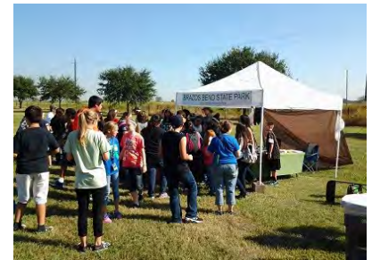
BBSPVO at the Texian Market Days.